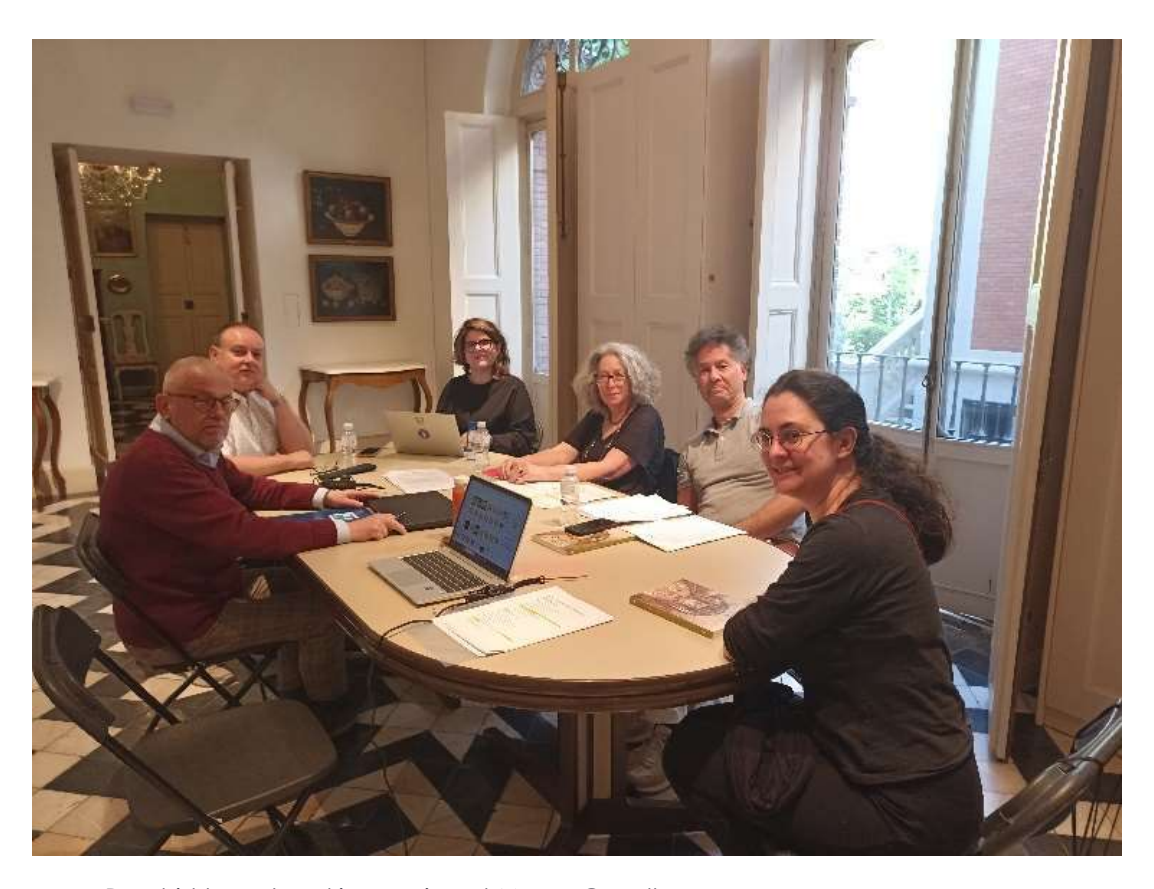
Demhist board working session at Museo Cerralbo.

The local meeting also provides the opportunity of networking between the board and local DEMHIST individual and institutional members, as well as professional visits of interest for the board.