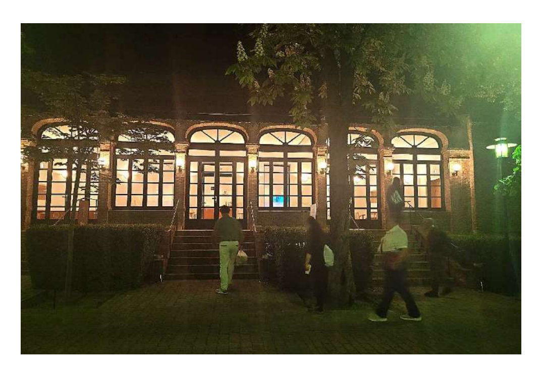
Board members returning to Residencia de Estudiantes

All the participants were kindly hosted at <u>Residencia de Estudiantes</u>, a Spanish public institution under the auspices of the Consejo Superior de Investigaciones Científicas (CSIC). This was of special interest for the board due to its history as a residence for artists, intellectuals and researchers. The Board was able to visit its historical rooms dating from the early 20th Century.