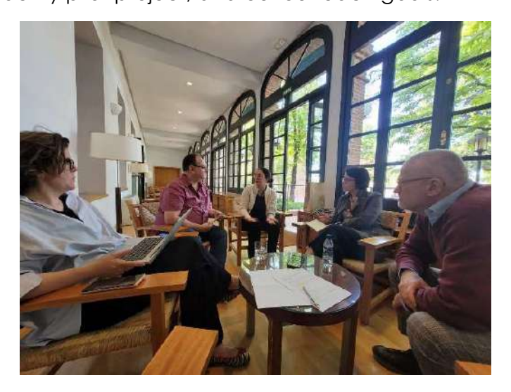
Working session at Residencia de Estudiantes

After breakfast, we gathered on the enclosed porch at the Residencia de Estudiantes for our first board meeting session, where we received updates regarding the 2025 Special Project Grants, International House Museum Day, the ICOM Academy pilot project, and our outreach goals.