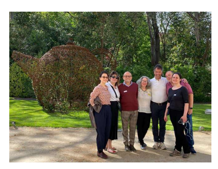
Demhist board in the gardens of Palacio de Liria